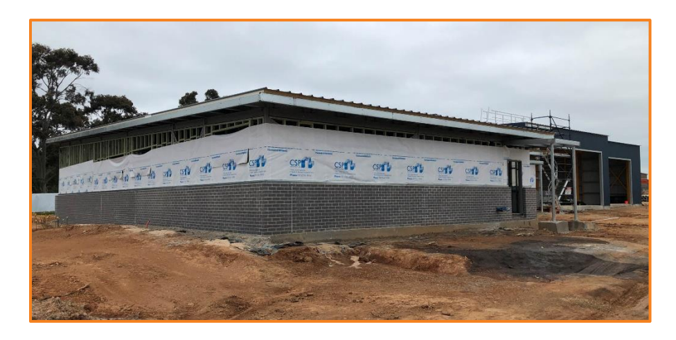
VICSES Wangaratta construction underway at 36 Handley Street, Wangaratta – October 2020.