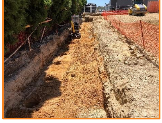
Construction for the new VICSES Knox Unit is now underway at 609 Burwood Highway, Knoxfield