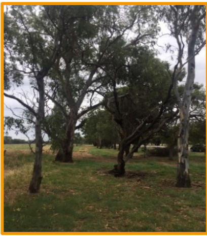
Road reserve trees